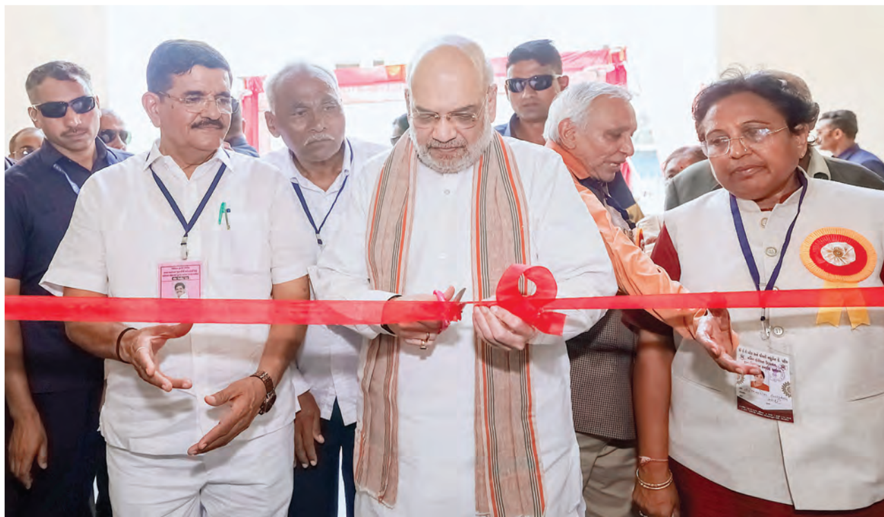
Union Home Minister and Minister of Cooperation Shri Amit Shah Speaks at a function in Mehsana